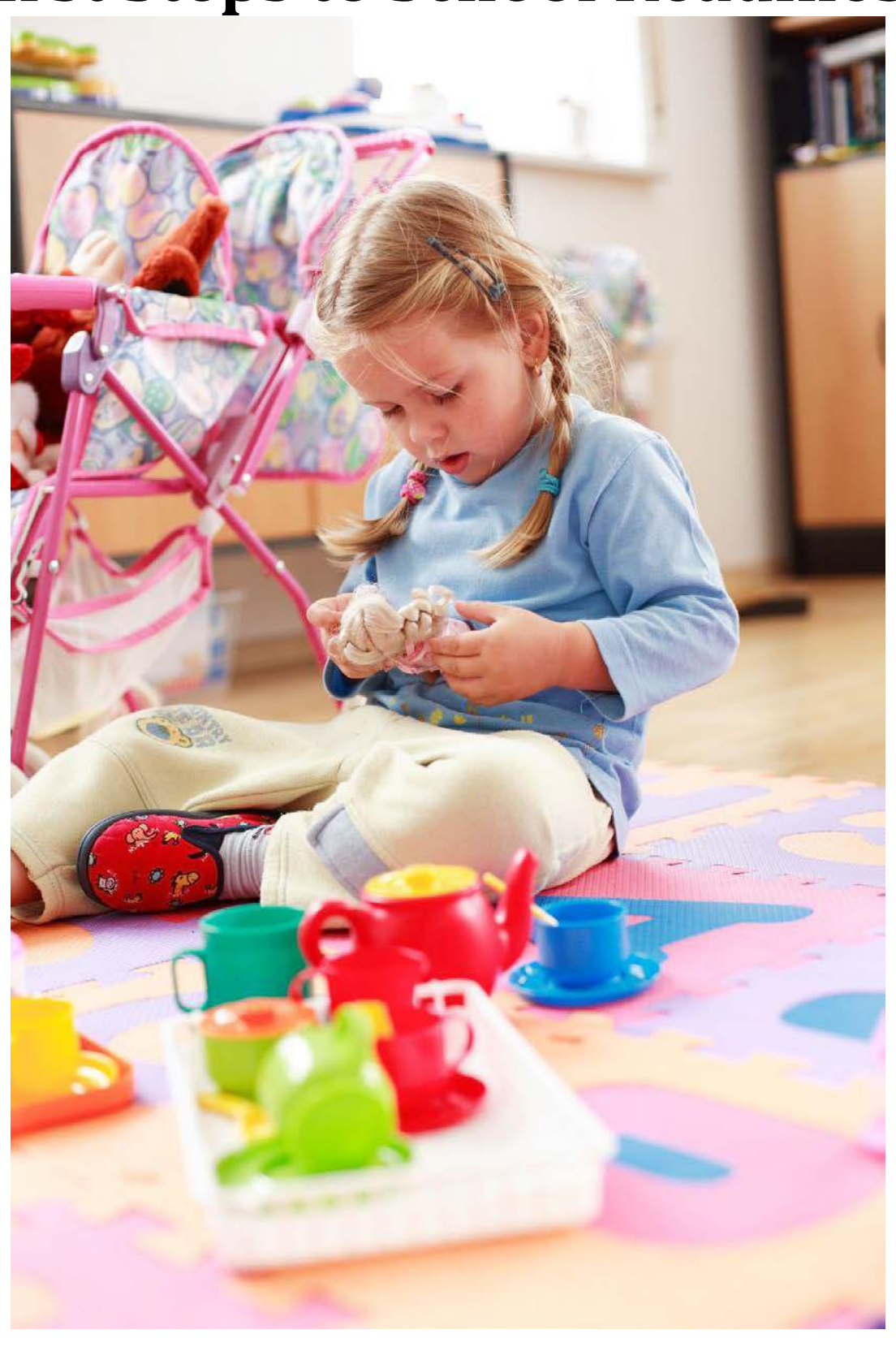
Annual Report 2013